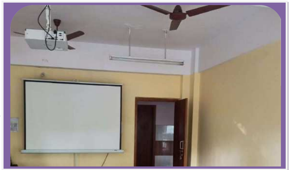
Smart Class Room 4