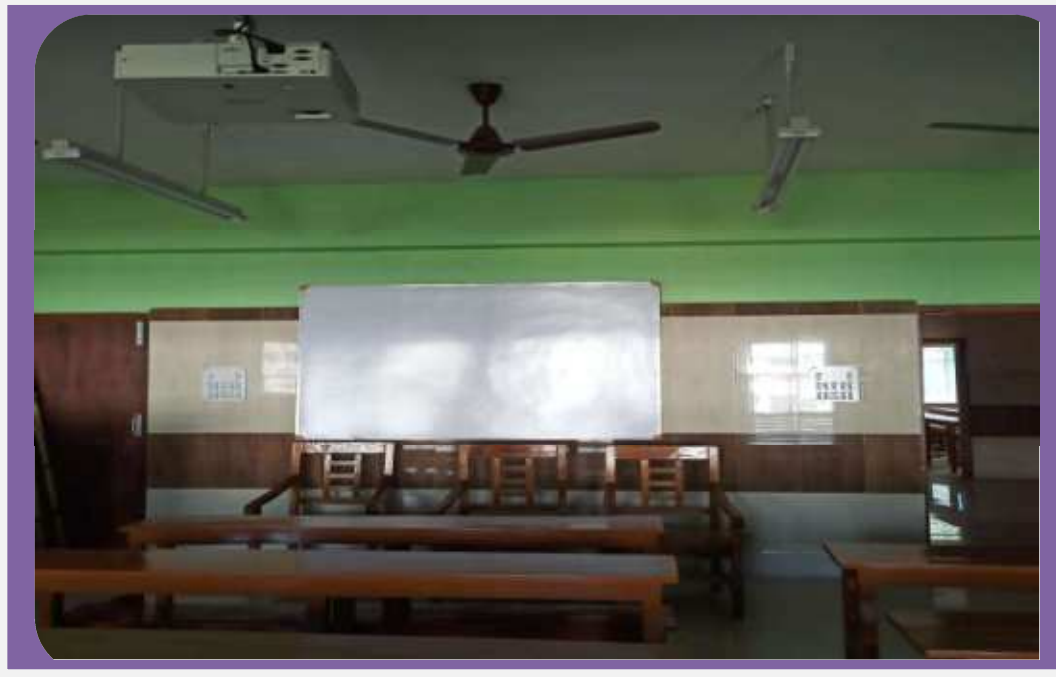
Smart Class Room