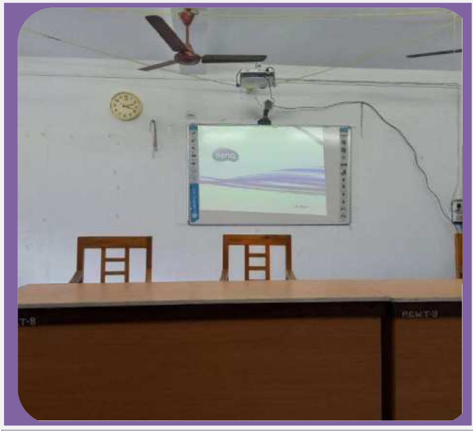
Smart Class Room 3