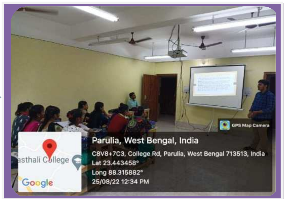
Smart Class Room 2